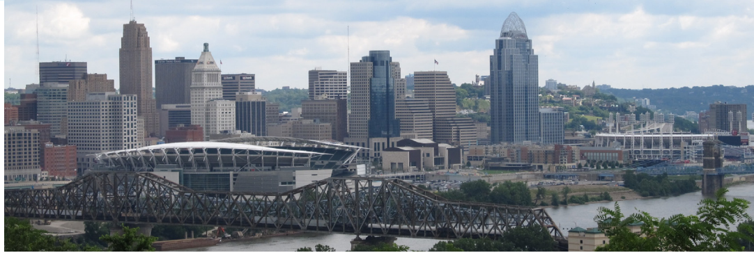
Cincinnati skyline.