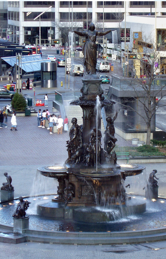
Cincinnati Fountain Square