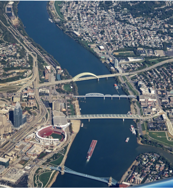
Ohio River, Cincinnati.