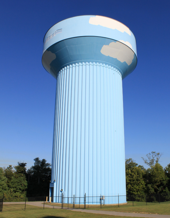
Boone Florence Water Commission Water Tower.

the late 1990s, keeping up the pace of improvement would require him either to find an influx of new customers or to increase water rates for his Cincinnati customer base.