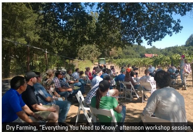
Dry Farming, "Everything You Need to Know" afternoon workshop session.

Made possible by The Dow Chemical Company, the Dow Sustainability Fellows Program at the University of Michigan supports full-time graduate students and postdoctoral scholars at the university who are committed to finding interdisciplinary, actionable, and meaningful sustainability solutions on local-to-global scales. The program prepares future sustainability leaders to make a positive difference in organizations worldwide.