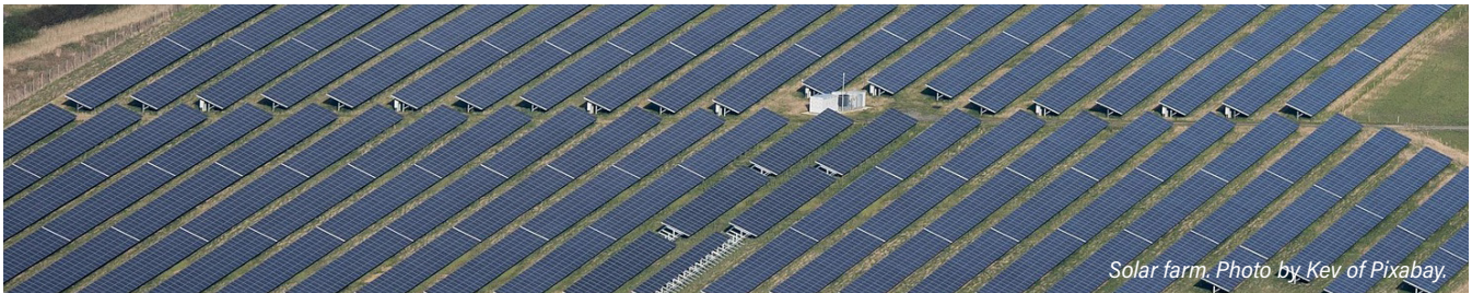
Solar farm.