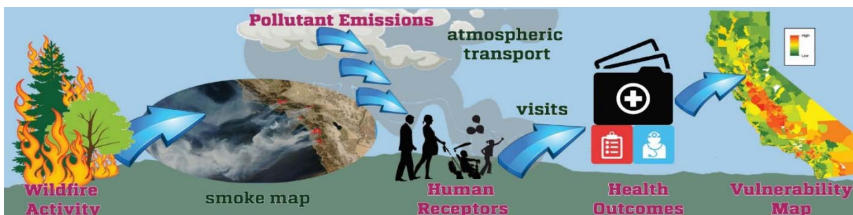
Figure 1: Conceptual overview for studying associations between wildfire smoke and health for mapping vulnerability.

tendency for O3 and both over and under-estimation for PM 2.5 impacts (Baker et al, 2016). Ideally, other modeling systems will be evaluated similarly against routine and special field study data in the future to improve confidence in predictions. Our main output from this grant was a larger grant proposal, and we proposed to rely on the CMAQ modeling platform. In developing that proposal, we acknowledged the strengths and limitations and expected opportunities to understand and refine the modeling platform more fully. We hope to communicate our findings via a publication in the peer reviewed literature.