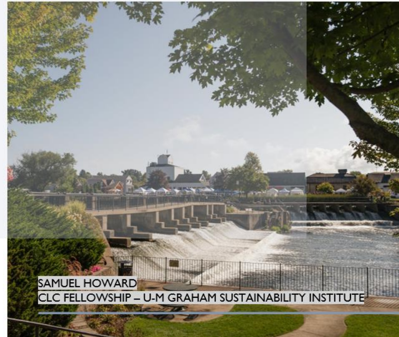
SAMUEL HOWARD CLC FELLOWSHIP – U-M GRAHAM SUSTAINABILITY INSTITUTE