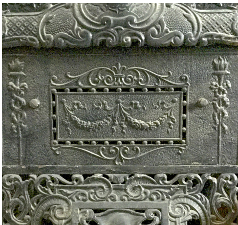
Metal fireplace grate in older home, Southwest Detroit