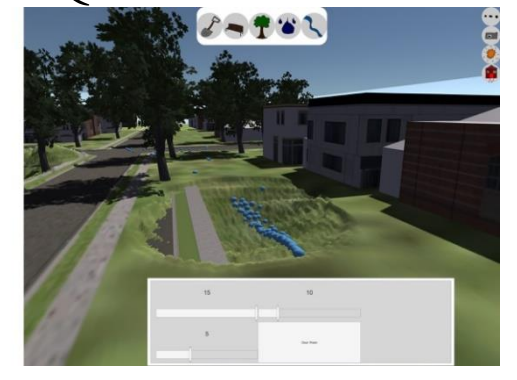
Fig. 1: Visualization of stormwater behavior 'painted' on terrain