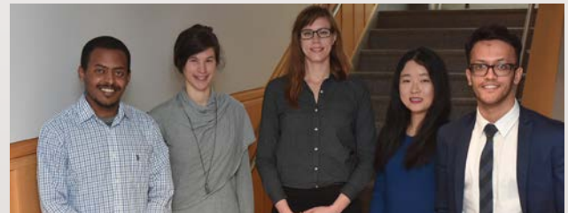
Using Technology to Engage Communities in Green Infrastructure Planning | Detroit, Michigan (2018)