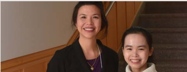
Dough: A Web Application That Simplified Student Loan Management | Michigan (2018)