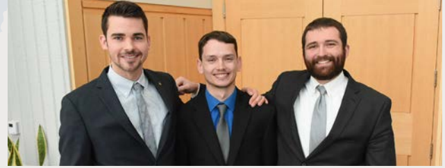
Developing a Net-Zero Biological Field Station in Costa Rica | Costa Rica (2019)