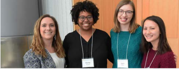
Social Life Cycle Assessment and Health Impacts of Ceramic Water Filters in Uganda | Uganda (2019)